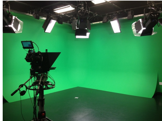
Goodyear Studio, Eaton High School

The evolution of television from the electronic transmission of pictures into a mass communications and artistic medium required the development of an entirely new lighting design art form. Although derived from the basic principles of still photography, the fundamentals of television lighting have evolved into a much more dynamic form to meet the needs of this uniquely demanding medium. The original requirement of providing enough light on the subject to produce a picture of transmission quality has progressed from the black and white "snows of times past" into a new age of technical excellence. In fact, television has become an artistic medium as much through the development and proper application of appropriate lighting fixtures and control systems as through camera improvements. Now, improved media formats including 4K and HD are increasing the need for superior lighting.