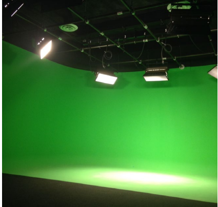
Mid-Michigan Community College

Obviously, this short discussion can only cover a few of the most basic principles of television lighting in a very general way. These principles are based on “tungsten” lighting technology, but these basics still apply in the use of newer fluorescent sources and the newest LED sources now commonly used for photographic, motion picture and television lighting. As the art and technology of television lighting continue their rapid development, we can look forward to the continued growth of television as a more artistic communication, entertainment, and cultural medium.