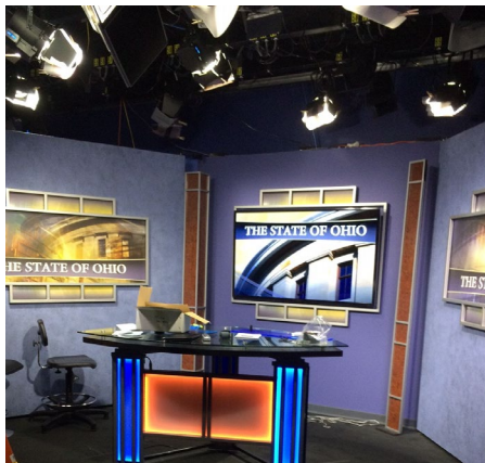
Ohio Channel Studio

Base lights establish the overall light level on the studio set. The scoop or floodlight is the most commonly used fixture for base lighting. A large wattage unit which is relatively uncontrollable in terms of focus, the base light must produce a soft edged field of light so that multiple units can be easily blended. Base lights may also be used to provide a color mixture on the set, if required. Ideally, base lights should have an adjustable focus mechanism to provide some measure of beam spread control.